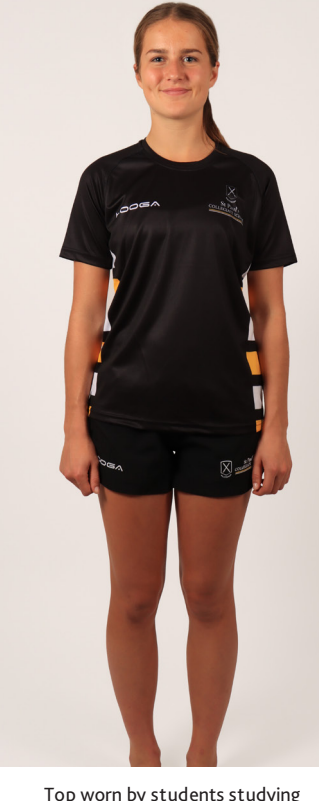
Uniform for sports teams are available Top worn by students studying Sports Science from the School Shop. Please enquire when sports teams are confirmed.